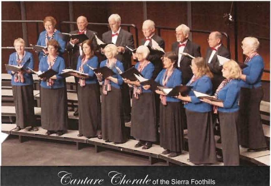
Cantare Chorale of the Sierra Foothills