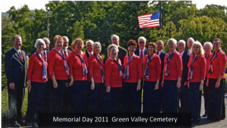
Memorial Day 2011 Green Valley Cemetery