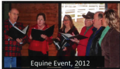
Equine Event, 2012