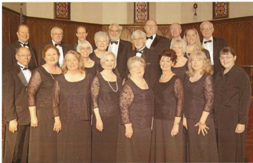
Cantare Choral of the Sierra Foothills